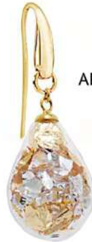
AIR 02 - 2A G FAO OR