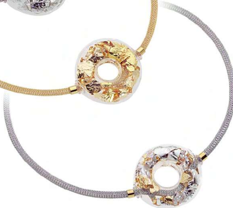
AIR 03 B FAO 45 cm

Lurex® fabric, silver components blown glass with silver or 24 Kt gold foils