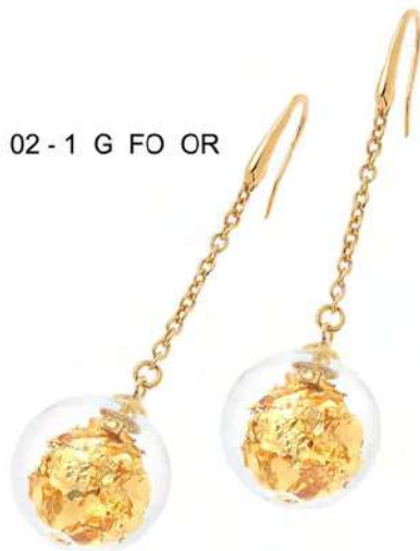
AIR 02 - 1 G FO OR