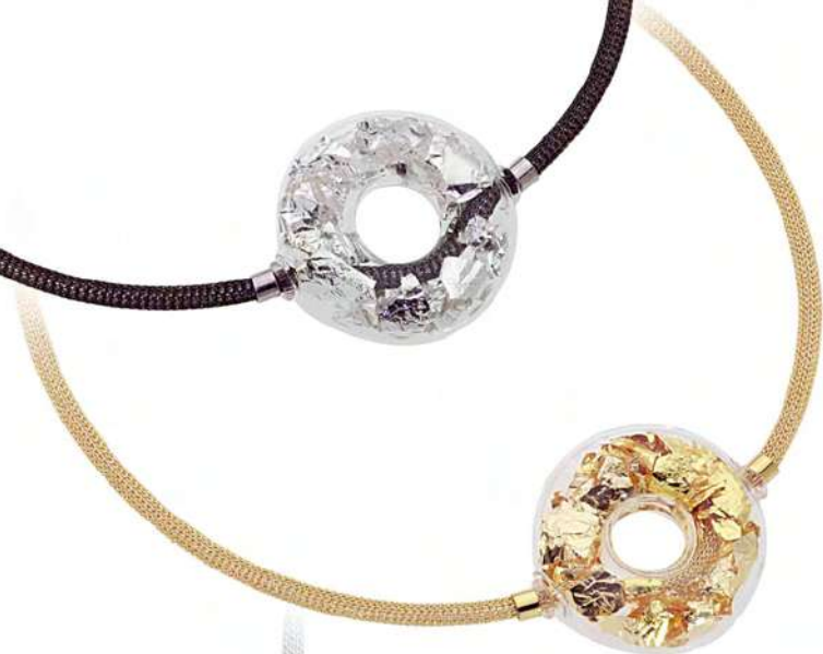
AIR 03 G FO