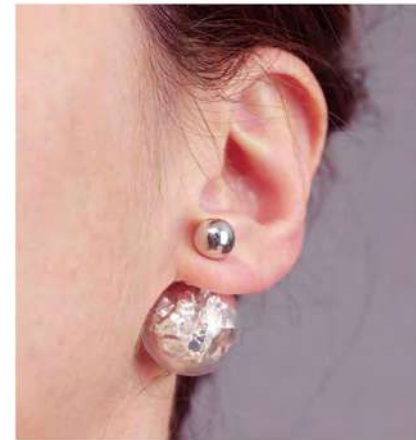
AIR 02 - D OR B FA