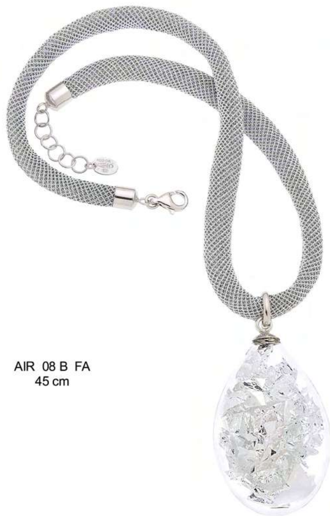
AIR 08 B FA 45 cm