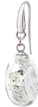
AIR 02 - 4A B FA OR