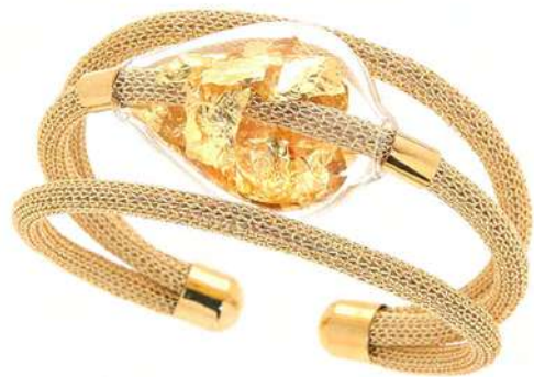
AIR 01 G BR FO