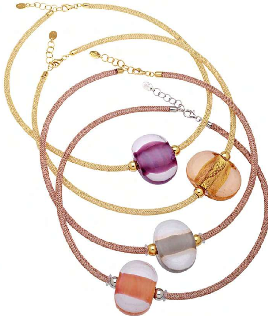
CANDY 01 CL 45 cm