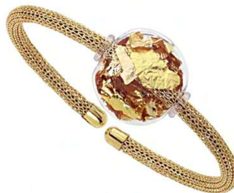
AIR 50 BR G FO