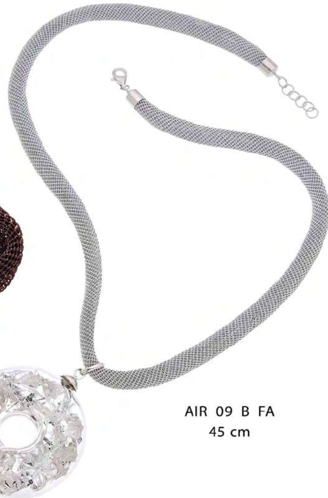
AIR 09 B FA 45 cm