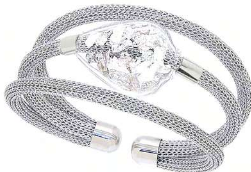
AIR 01 B BR FA