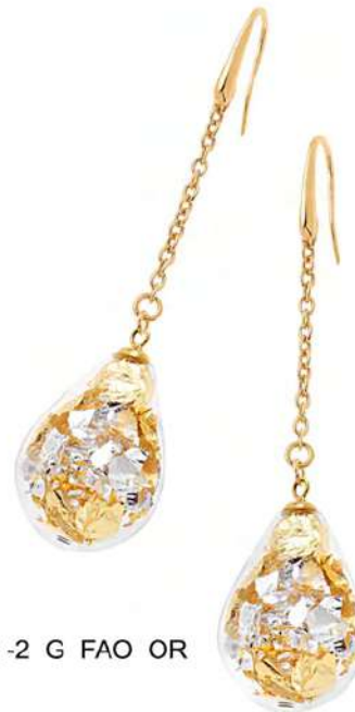
AIR 02 - 2 G FAO OR