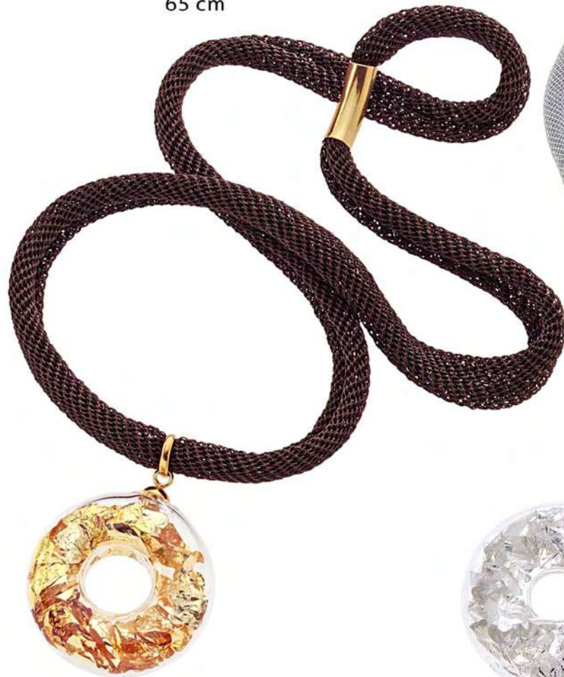
AIR 09 - NC BZ FO 65 cm