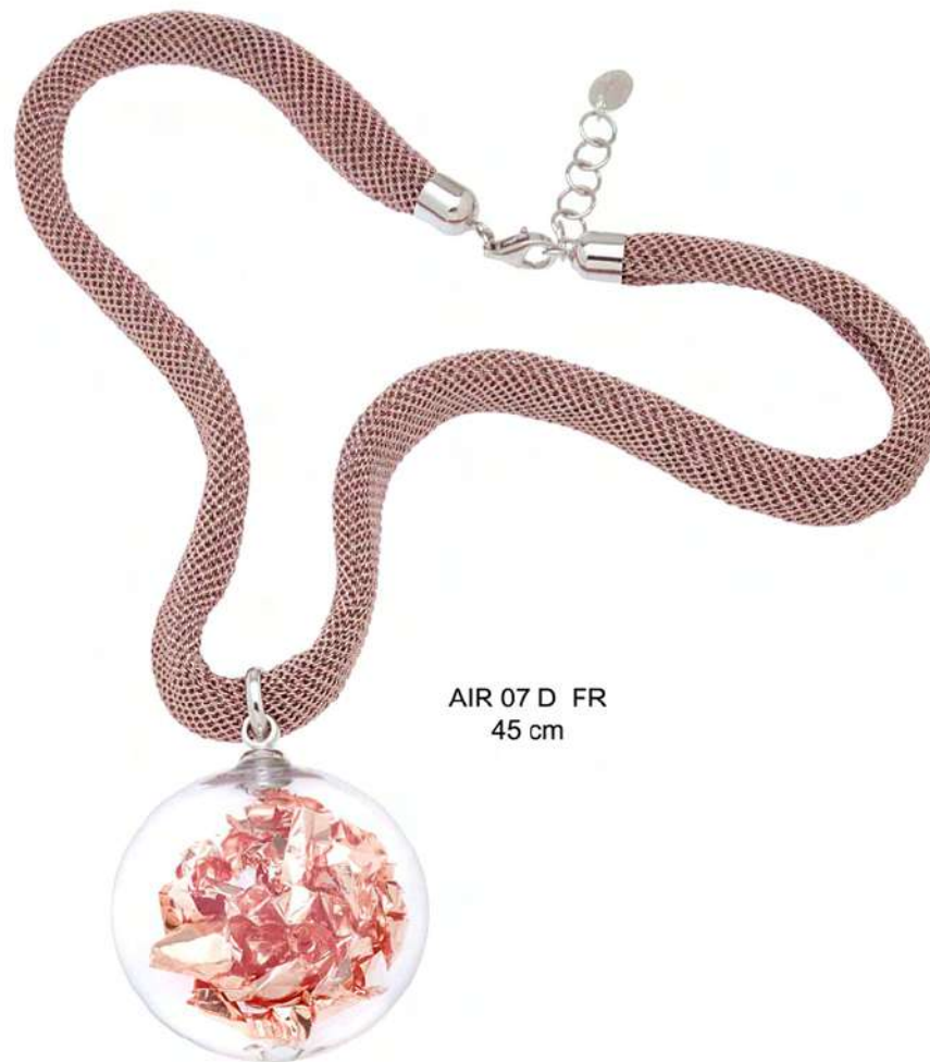
AIR 07 D FR 45 cm