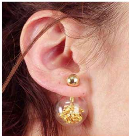
AIR 02 - D OR G FO