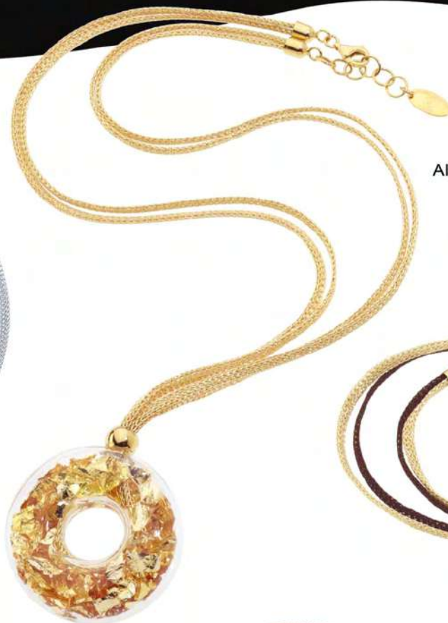
AIR 10 G FO 55 cm