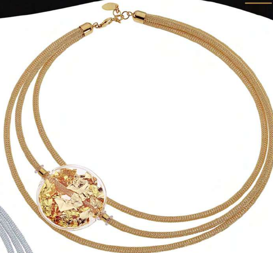
AIR 01 - TP G FO 45 cm