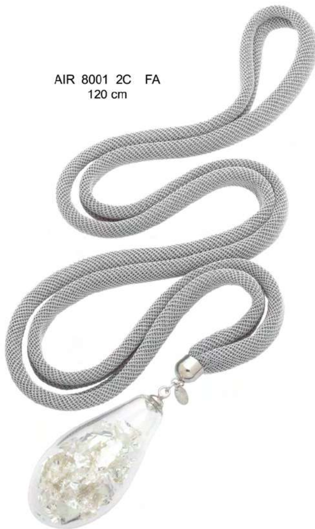
AIR 8001 2C FA 120 cm