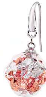
AIR 02 - ANF A B FAR OR