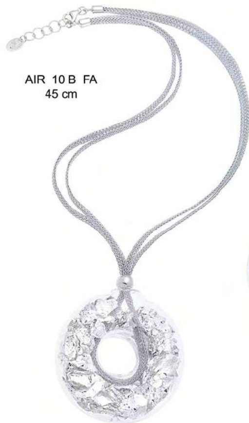
AIR 10 B FA 45 cm