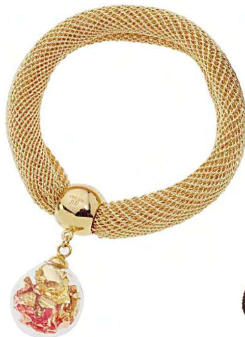
AIR 60 G FO