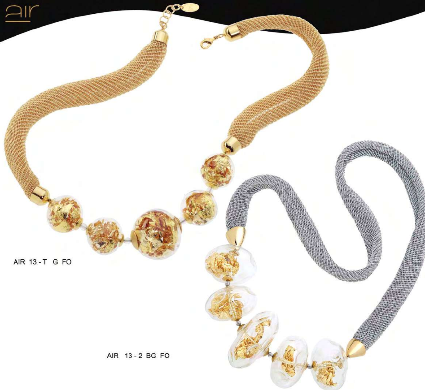
AIR 13-T G FO