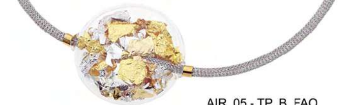
AIR 05 - TP B FAO