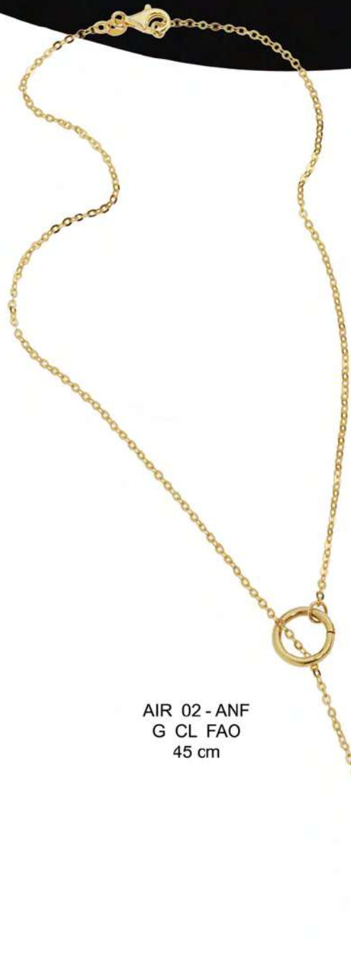
AIR 02 - ANF G CL FAO 45 cm