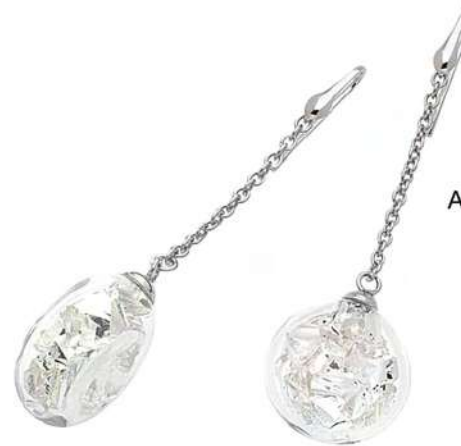
AIR 02 - 4 B FA OR