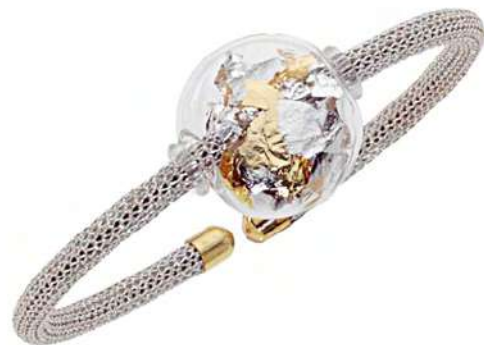
AIR 50 BR BPS FAO