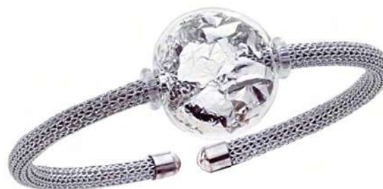
AIR 50 BR B FA