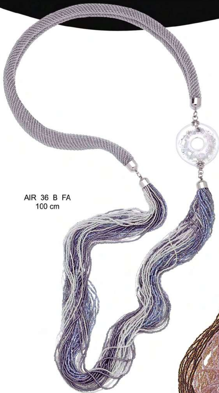
AIR 36 B FA 100 cm