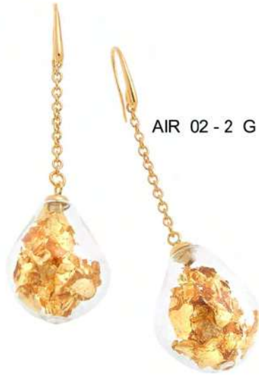
AIR 02 - 2 G FO OR