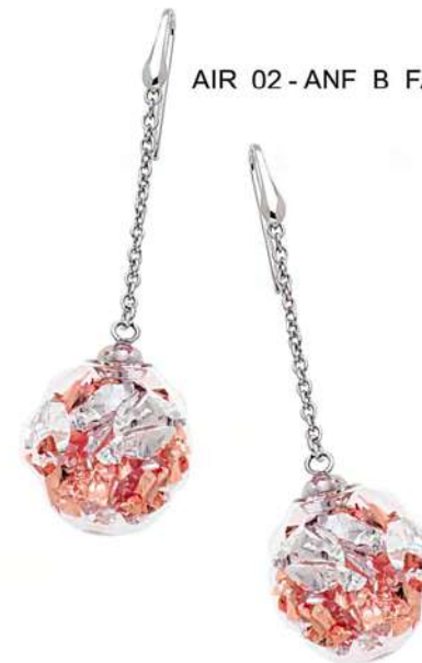
AIR 02 - ANF B FAR OR