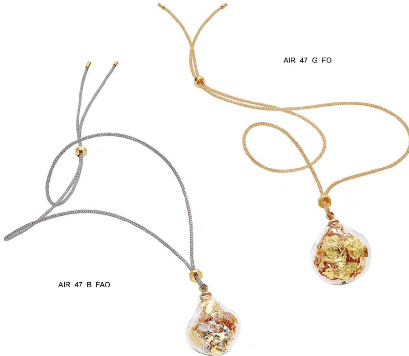
AIR 47 B FAO