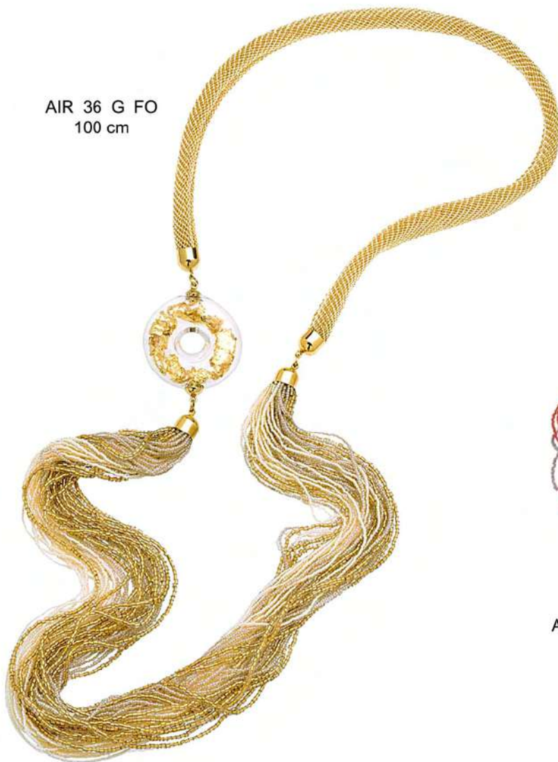
AIR 36 G FO 100 cm