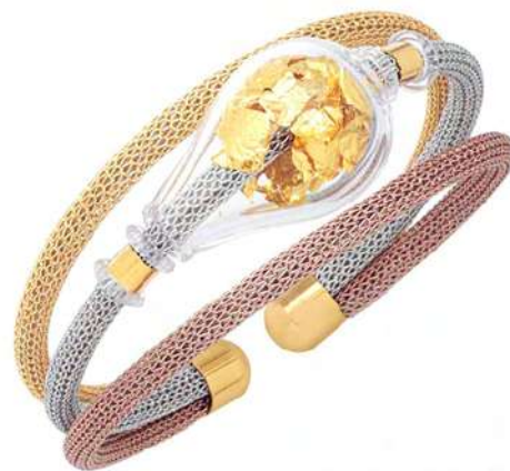
AIR 01 3C BR FO