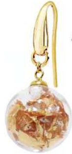
AIR 02 - 1AG FO OR