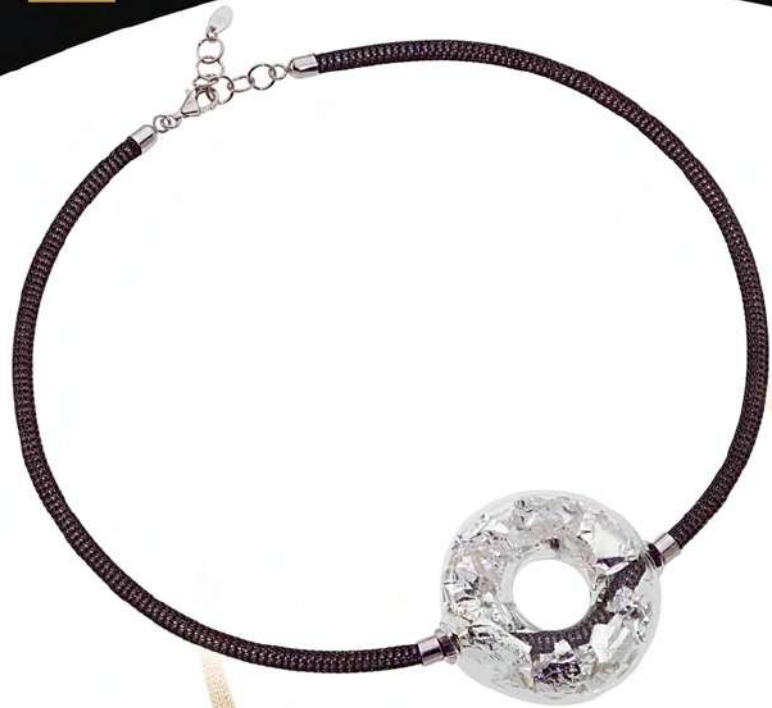
AIR 03 SMK FA